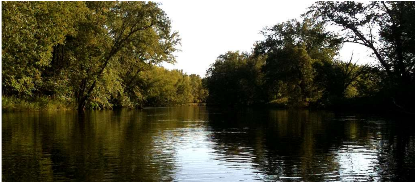
Rum River Beauty